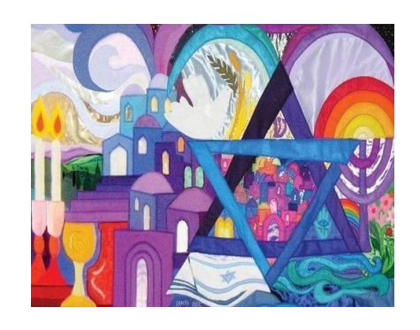
Lay Services April 25<sup>th</sup>, 7:00 p.m.