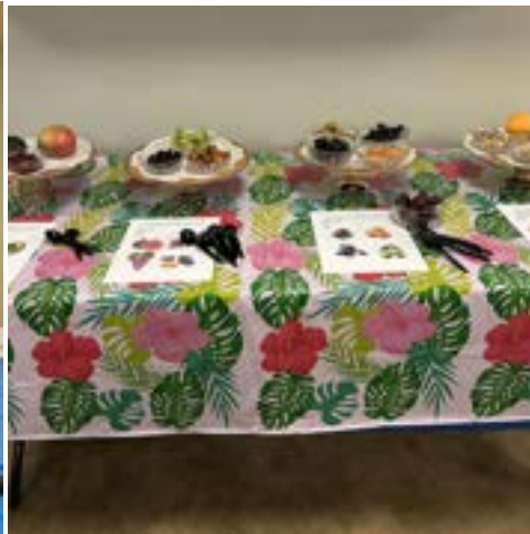
The species ready for tasting.