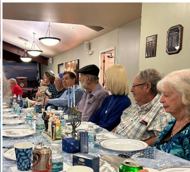
Guests seated for dinner