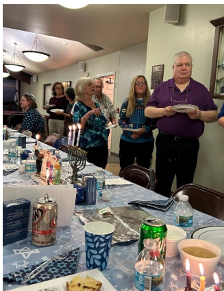
Guests in line for dinner