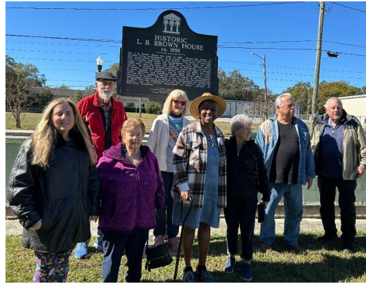
Brotherhood/Sisterhood members with our Tour Guide