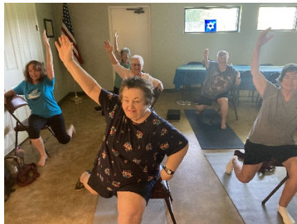
A great action photo of the Tuesday morning Yoga practice.