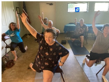
A great action photo of the Tuesday morning Yoga practice.