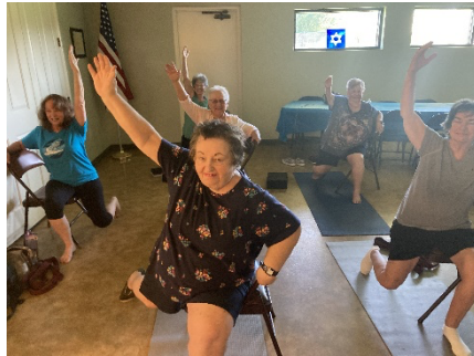
A great action photo of the Tuesday morning Yoga practice.