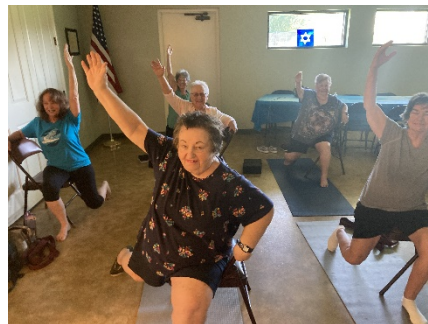
A great action photo of the Tuesday morning Yoga practice.