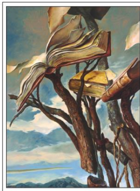
PAINTER OF QUESTIONS

Join us on December 10 th , 2023, 3 p.m.