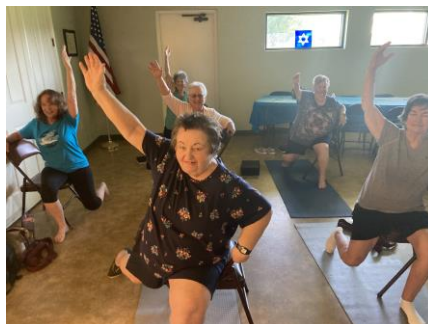
A great action photo of the Tuesday morning Yoga practice.