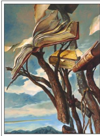
PAINTER OF QUESTIONS

Join us on November 19 th , 2023, 3 p.m. Temple Beth Shalom Brotherhood/Sisterhood "Remembering Vilna: The Holocaust and the Art of Samuel Bak"